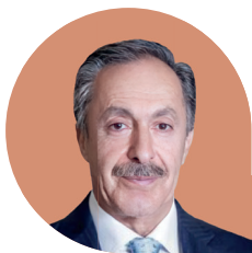
Abdulkarim Kabariti Board Member (Independent)

Abdulkarim Kabariti is a prominent leader with extensive experience in the banking, economic, and political fields. He has held several leadership positions in Jordanian governments, in addition to his active role in the financial and investment sectors at the regional and international levels. Kabariti holds a Bachelor's degree in Business Administration and Financial Management with honors from St. Edward's University, USA. He also holds an honorary doctorate in Business Administration from Coventry University, UK.